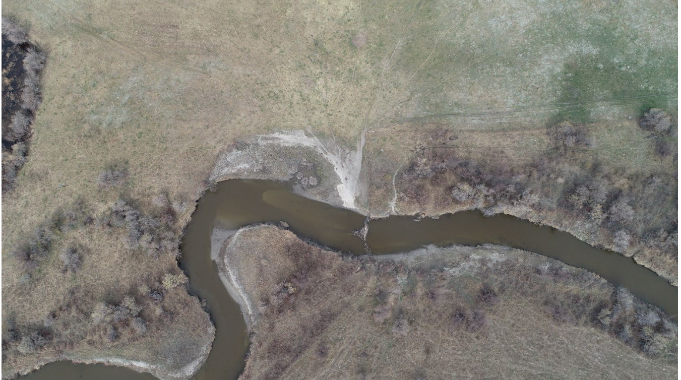
Figure 1: Aerial view of Turtle River crossing location